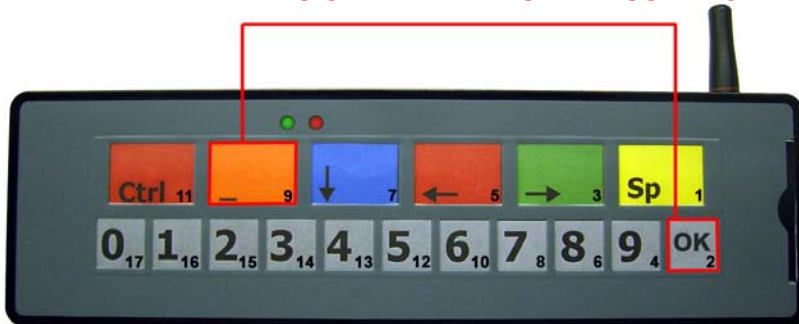
TG3 17 Key Bump Bar

(WARNING – THE KEY NUMBER IS NOT WHAT IS PRINTED ON THE LEGEND BUT THE VERY SMALL NUMBER IN THE LOWER RIGHT HAND OF EACH KEY. ALL TG3 BUMP BARS HAVE A INTERNAL DESIGNATED KEY NUMBER USED FOR PROGRAMMING PURPOSES)